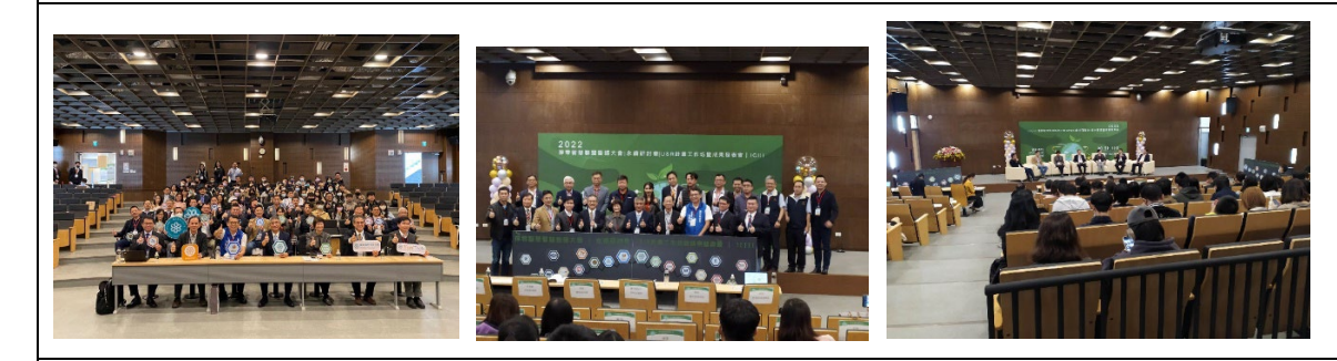
永續發展論壇 Hosting of the Sustainability Forum for local enetrprises