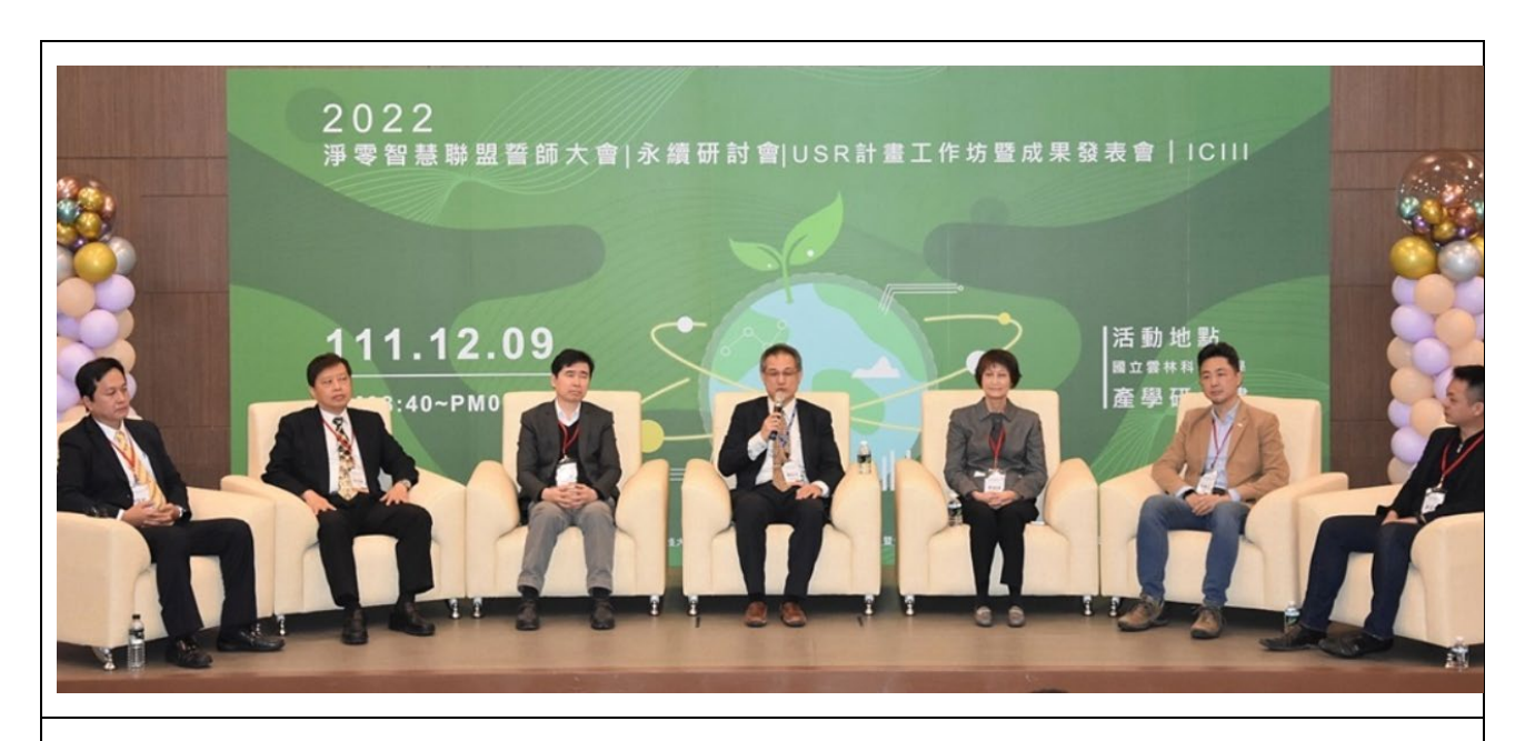
永續發展論壇 Hosting of the Sustainability Forum for local enetrprises