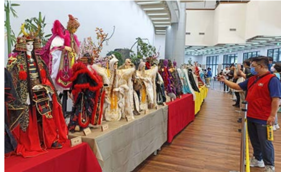
Traditional Puppet Show Exhibition in YunTay Performance Hall