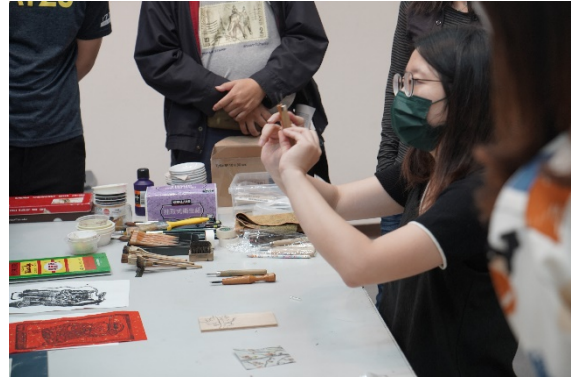
Woodblock printing workshop