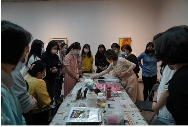
Flower pressing experience workshop