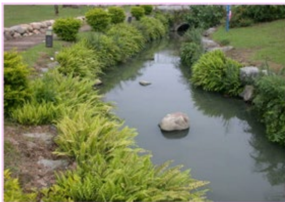
(8) Artificial lake supplementary water