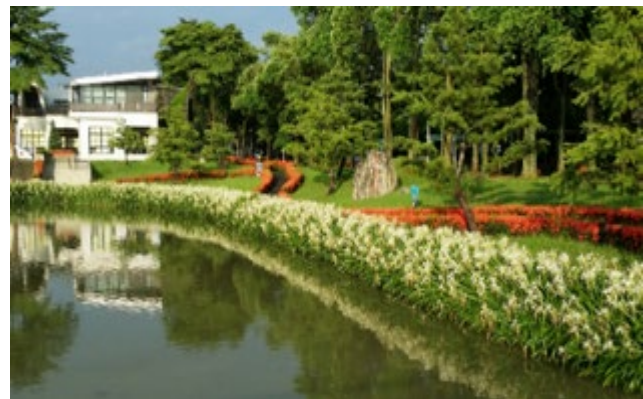
(9) Artificial lake supplementary water