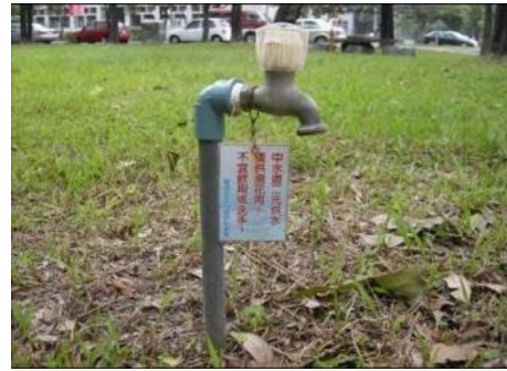
(5) Watering plants with recycled water