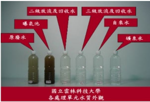
(4) Appearance of water quality of each treatment unit of sewage treatment facility