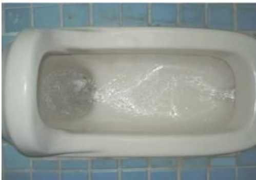
(6) Water-saving flush toilet